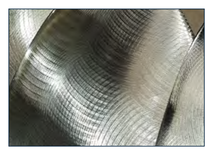
A Max-Prop propeller sanded thoroughly using 80 grit sand paper.