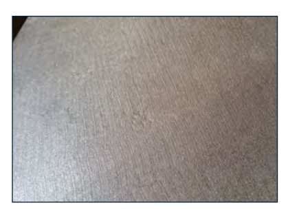
A propeller sandblasted.